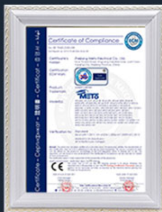
Certification of CE