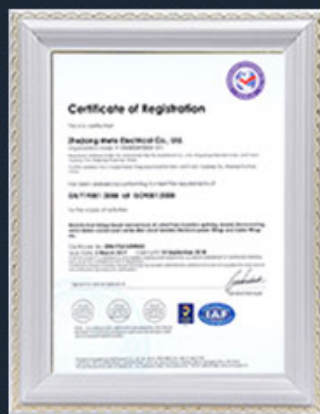
Certification of ISO9001