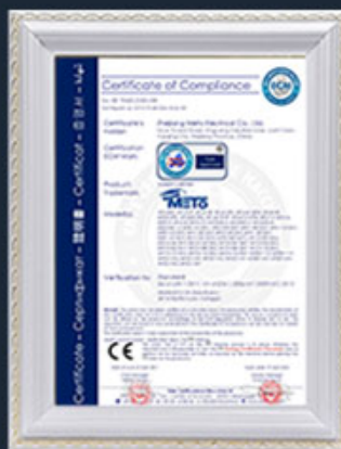
Certification of CE