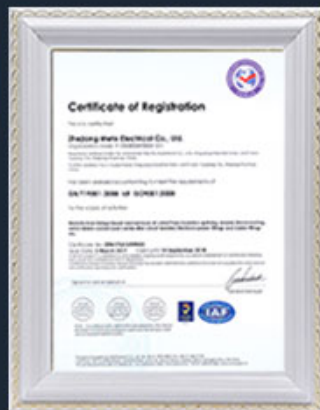
Certification of ISO9001